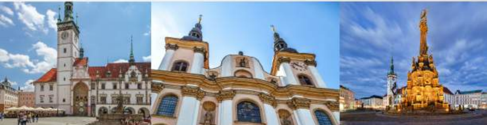
OLOMOUC - ATTRACTIONS

Olomouc is a famous centre of education, science and research, and during the academic year, about 25000 students study there. It is also famous for its numerous fountains, unique facades, green parks, and beautiful nature surrounding the town. Every year, it hosts numerous cultural and sport events (concerts, theatre and ballet performances, national heritage and costume events, flower exhibitions, half marathon, etc.) Olomouc has a convenient location close to central European capitals, such as Vienna (Austria), Bratislava (Slovakia), Budapest (Hungary), and other remarkable cities, such as Krakow.